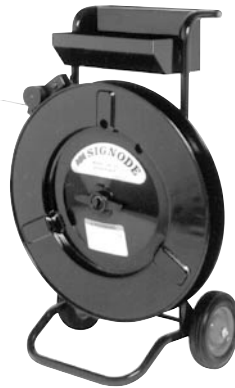
DF-15 For typical shipping room. Easily loaded with mill wound coils.