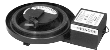
DP-1-23B Electric-powered DF-23 for power equipment only. Cover required for strap over 0.023" (0.58 mm). Cover sold separately.