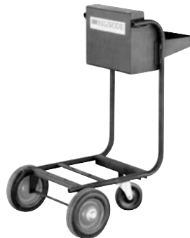
DM-23 Makes the DF-23 mobile.