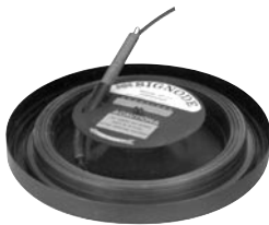
DF-23 Fits almost anywhere. Pays off from the inside of the coil. Mobile with optional DM-23 cart. Cover required for strap over 0.023" (0.58 mm). Cover sold separately.