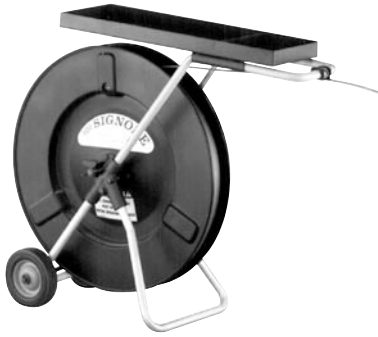
DF-7A Inexpensive model for mill wound coils. General use.