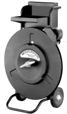
DF-10RW Accepts mill wound or ribbon wound coils 3/4" and 1-1/4" in width.