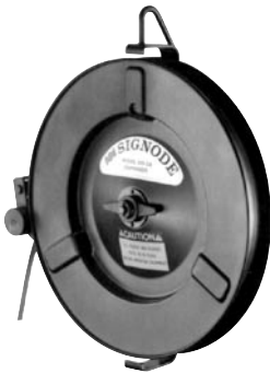
DO-3A Overhead dispenser for mill wound coils. Wall (WB) and ceiling (CB-9) mounting brackets available.