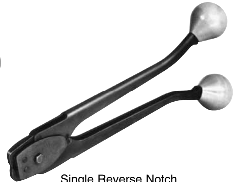
Single Reverse Notch SRC-3820 SRC-1223 SRC-5823 SRC-3423